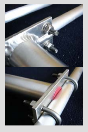
Heavy-duty dipole fixture