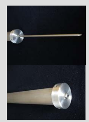
Optional lightning rod

*Site-specific mounting hardware is necessary with theses antennas. Please consult JAG to determine suitable clamps for your application